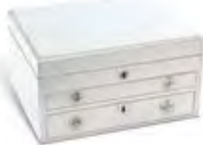
ALPINE PIANO WHITE