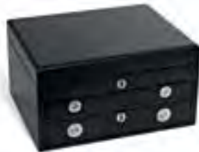
EBONY PIANO BLACK