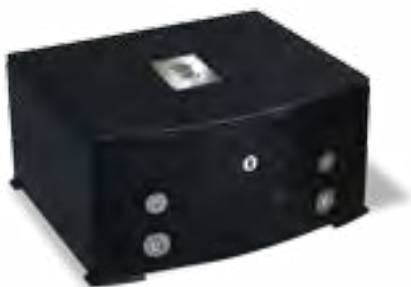
Diablo cabinet with example of inlaid sterling silver plaque featuring an engraved crest.